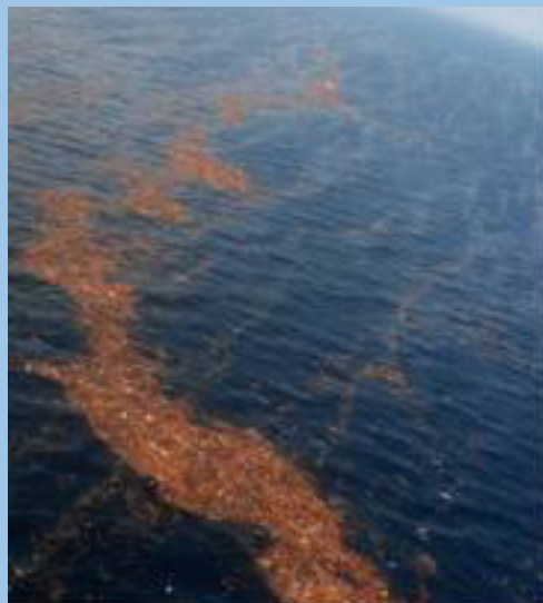
The mass of debris stretches for miles off the Honshu Coast.