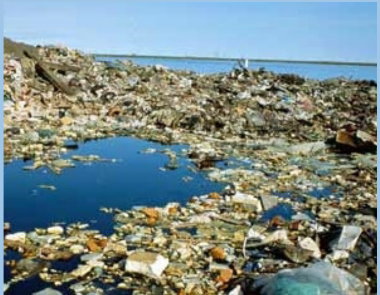
Image of the Pacific Ocean Garbage Patch from MarineInsight.com .

The earthquake and tsunami that struck Japan back in March of 2011 may have generated as much as 20 million tons of debris. Large items such as refrigerators, cars, even fishing boats, have been carried in a raft of debris estimated to spread across an area 2,000 miles long and 1,000 miles wide between Japan and the Midway Atoll. Independent models run by NOAA and University of Hawaii researchers suggest that some debris could pass near or wash ashore in the Northwestern Hawaiian Islands as early as this (2011/2012) winter, approach the West Coast of the United States in 2013, and circle back to Hawaii (the main Hawaiian Islands) from 2014 to 2016. The research center has asked boaters traveling in the area of the debris raft to send details such as GPS data, time, weather and descriptions of items found.