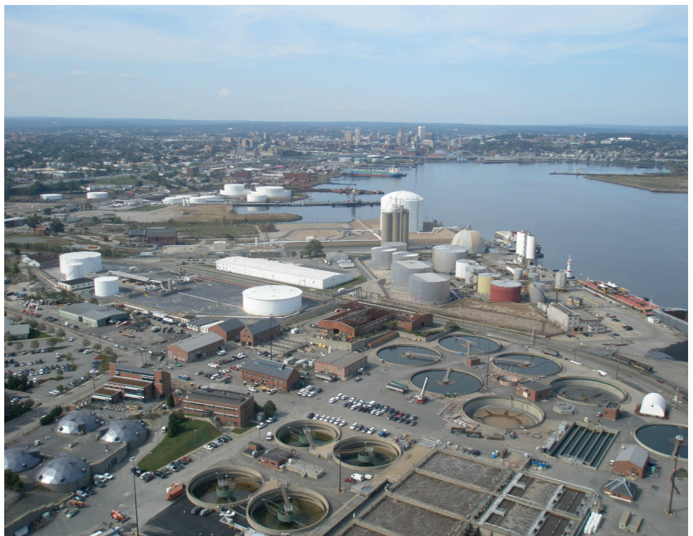
The Narragansett Bay Commission Fields Point Wastewater Treatment Facility.

Nitrogen is an essential element in the proteins that humans and animals need to live. It's also the nutrient exerting the greatest control over primary growth in marine waters (Phosphorus is the other major nutrient, but its effects are much more pronounced in fresh water.) Unfortunately, humans